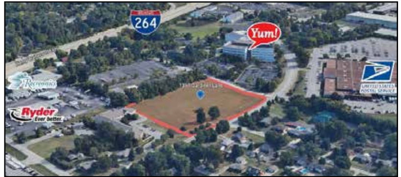
Aerial view of 1391 Gardiner Lane (outlined in red), showing its proximity to surrounding business and residential properties.