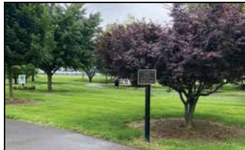
The Lillian Wild Walking Path/The Norman Liebert Green, located at Gardiner Lane and Gardiner View Avenue, has a paved 1/6-mile walking path; sitting benches; trash receptacle; and a beautiful variety of trees, many of which have identifying markers. It is available for your use and enjoyment daily from sunrise until sunset.