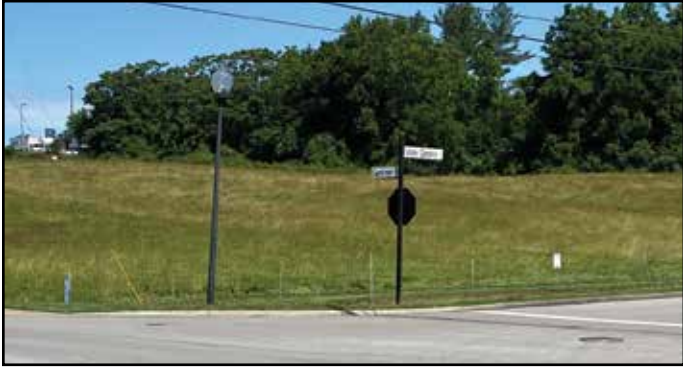
View of 1391 Gardiner Lane from the corner of Gardiner Lane and Colonel Sanders Lane (above); views with Candlewood Inn and Yum! headquarters in background (right).